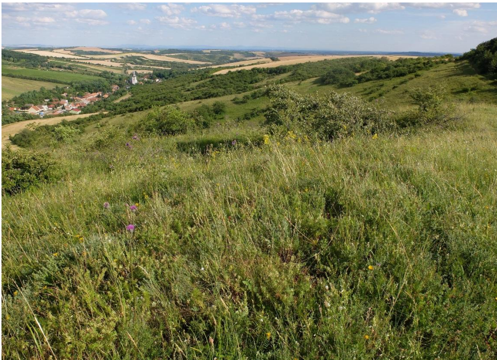
Pannonian grasslands in the „Kamenný vrch u Kurdějova“ reserve (Photograph by I. Malenovský).