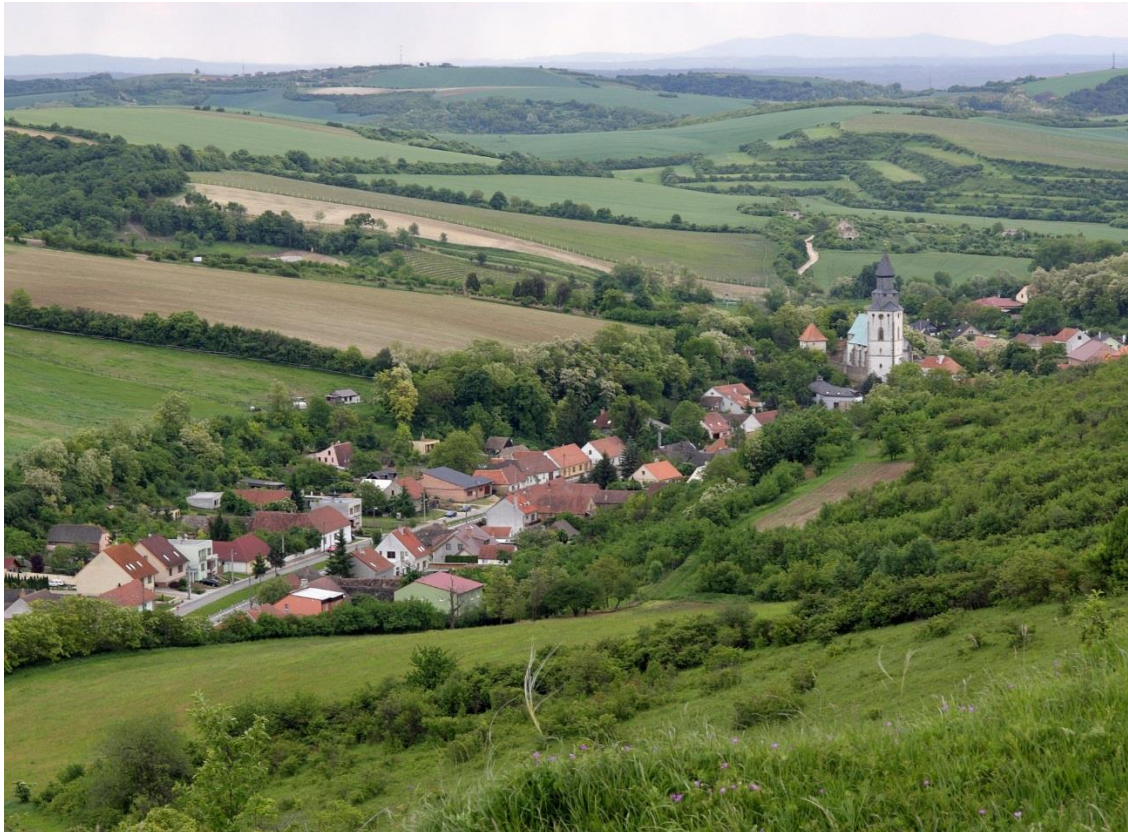
A view of the village of Kurdějov

prehistoric settlements or to the Cultural Landscape "Lednice–Valtice" with castles, parks and ponds.